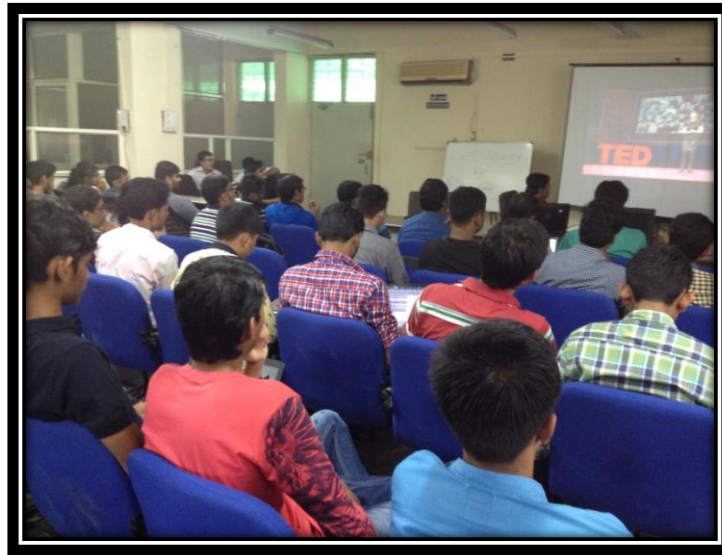
Students of various colleges during the event