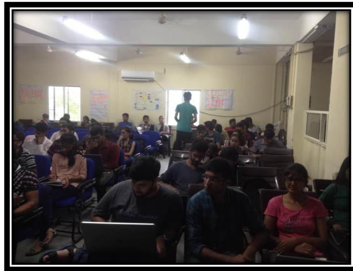
Students doing practical during the session